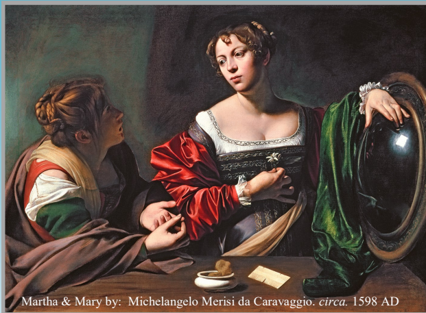
Martha & Mary by: Michelangelo Merisi da Caravaggio. circa. 1598 AD