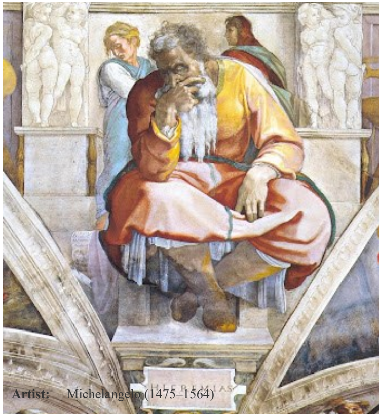
Artist: Michelangelo (1475-1564)